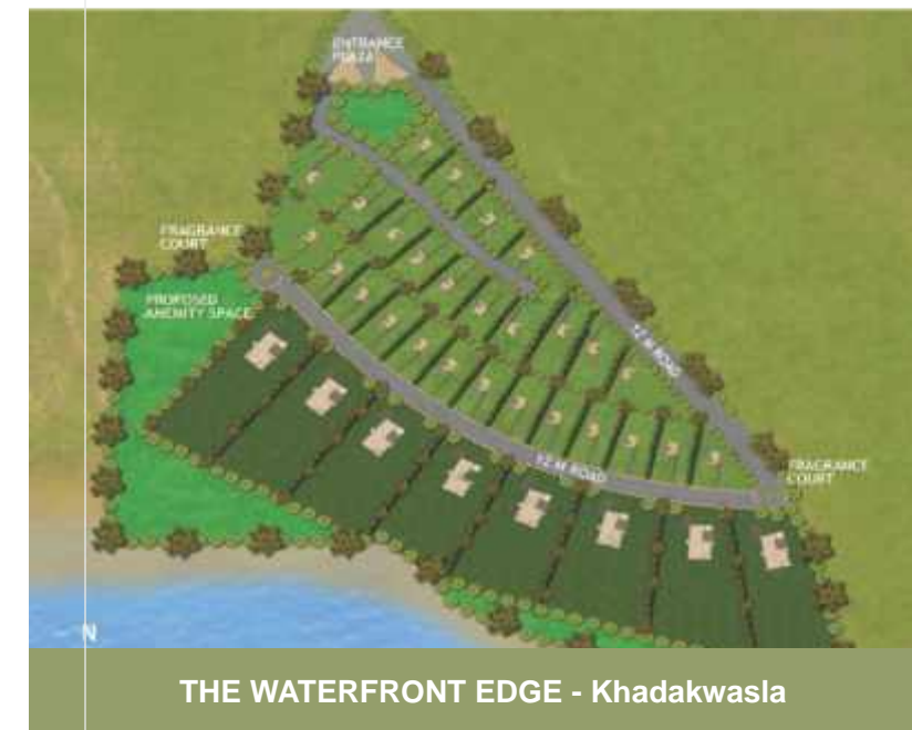
THE WATERFRONT EDGE - Khadakwasla