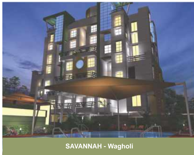
SAVANNAH - Wagholi