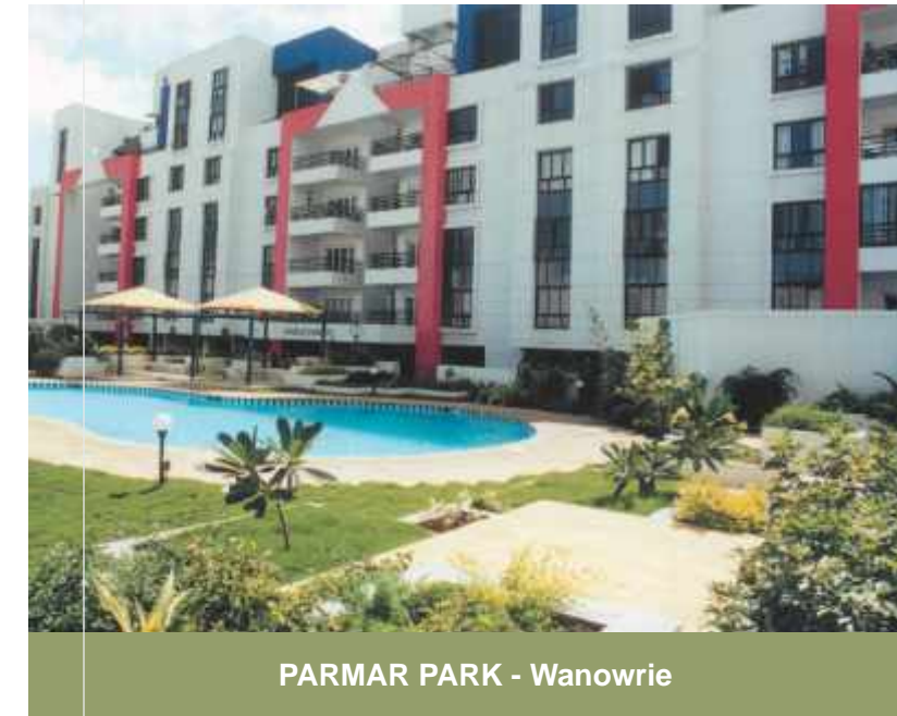
PARMAR PARK - Wanowrie