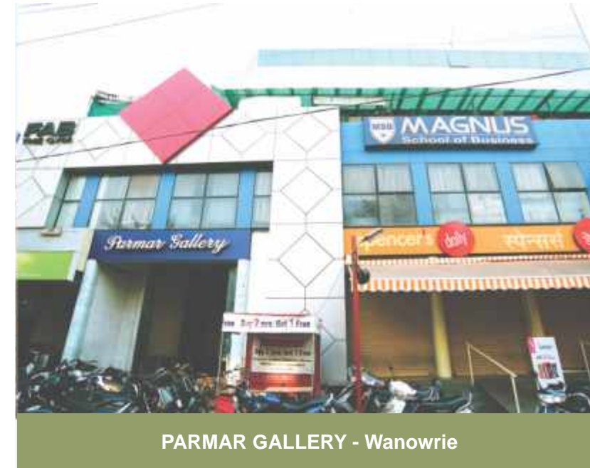
PARMAR GALLERY - Wanowrie