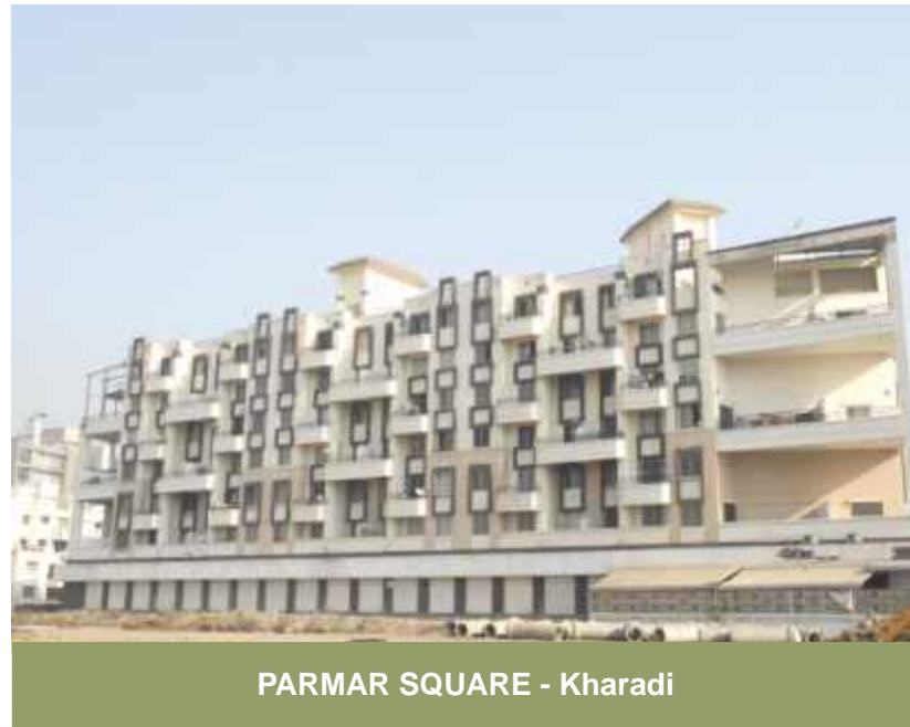
PARMAR SQUARE - Kharadi