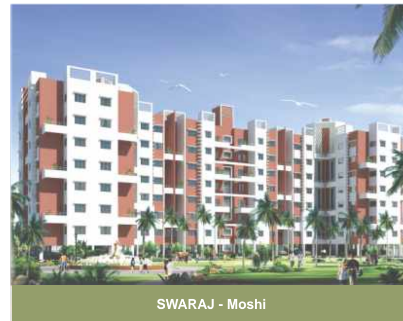
SWARAJ - Moshi